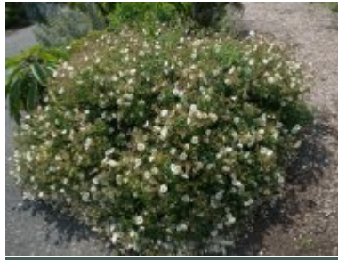
Cistus x aguilarii 'Maculatus'