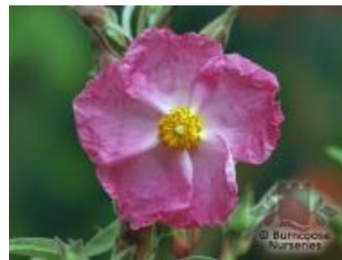
Cistus x argenteus 'Silver Pink'

Cistus x purpureus reddish purple flowers in terminal clusters of three on greyish green foliage.