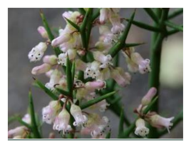
Colletia armata 'Rosea'

The branches of colletia form succulent flat or triangular mid blue-green or grey-green spines which point outwards from the shoots. Conventional leaves are almost totally absent except in young plants.