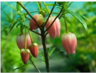
Crinodendron hookerianum 'Ada Hoffman'

C. hookerianum 'Ada Hoffman' has delightful pink lantern flowers but is perhaps even more temperamental to get going.