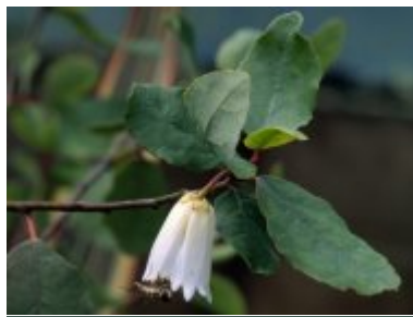
Crinodendron hookerianum 'Ada Hoffman'