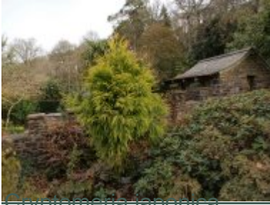
Cryptomeria japonica 'Sekkan-sugi'