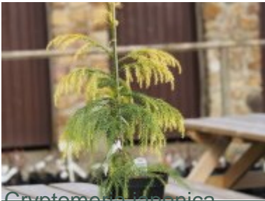
Cryptomeria japonica 'Sekkan-sugi'