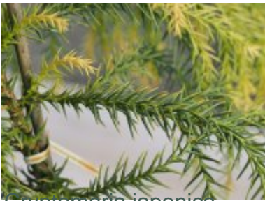
Cryptomeria japonica 'Sekkan-sugi'