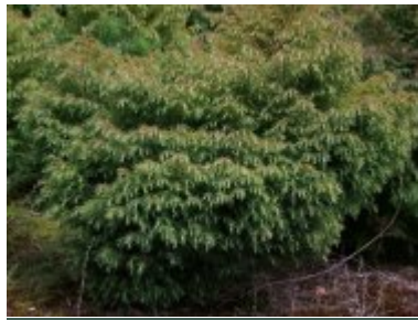
Cryptomeria japonica 'Elegans Aurea'