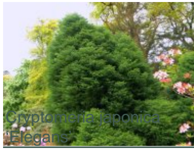
Cryptomeria japonica 'Elegans'