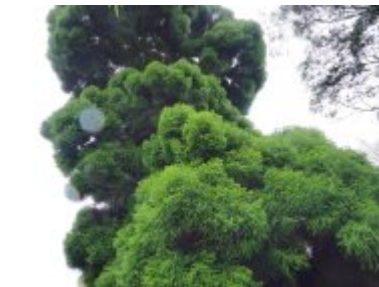
Cryptomeria japonica 'Spiralis'