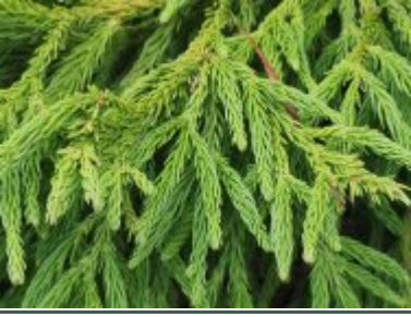
Cryptomeria japonica 'Spiralis'

View this video on Youtube here https://www.youtube.com/VEUIeNuvSSY