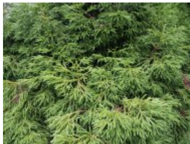
Cryptomeria japonica 'Spiralis'