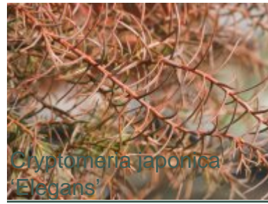
Cryptomeria japonica 'Elegans'