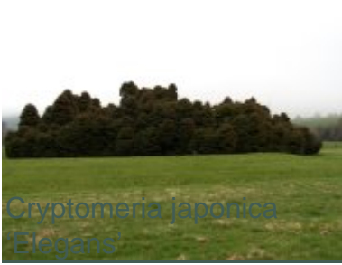
Cryptomeria japonica 'Elegans'