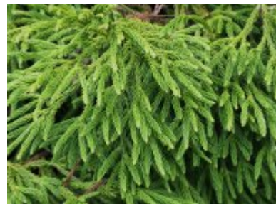
Cryptomeria japonica 'Spiralis'