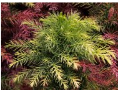
Cryptomeria japonica 'Elegans Aurea'