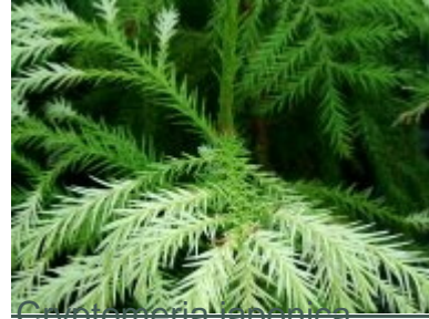
Cryptomeria japonica 'Sekkan-sugi'