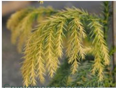
Cryptomeria japonica 'Sekkan-sugi'