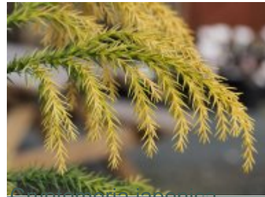
Cryptomeria japonica 'Sekkan-sugi'