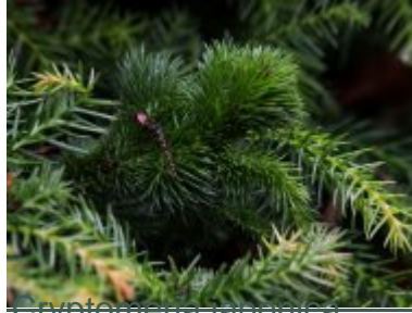
Cryptomeria japonica 'Sekkan-sugi'