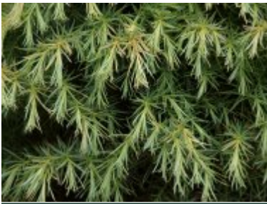
Cryptomeria japonica 'Elegans Aurea'