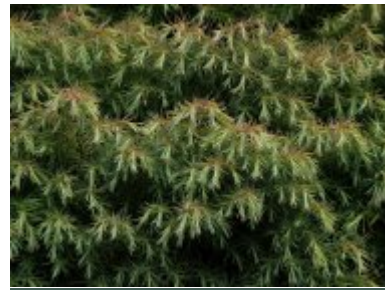
Cryptomeria japonica 'Elegans Aurea'