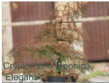
Cryptomeria japonica 'Elegans'