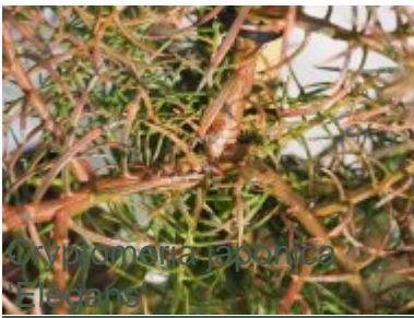
Cryptomeria japonica 'Elegans'