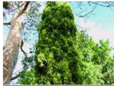
Cupressus sempervirens 'Swane's Gold'