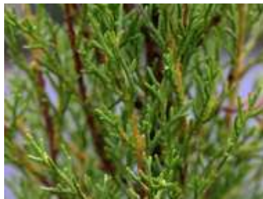
Cupressus sempervirens 'Stricta'