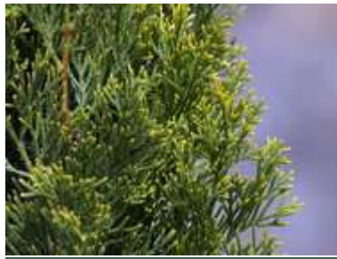
Cupressus sempervirens 'Swane's Gold'