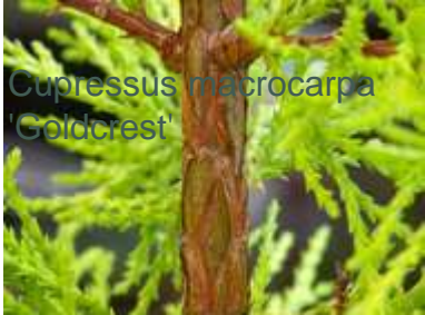
Cupressus macrocarpa 'Goldcrest'