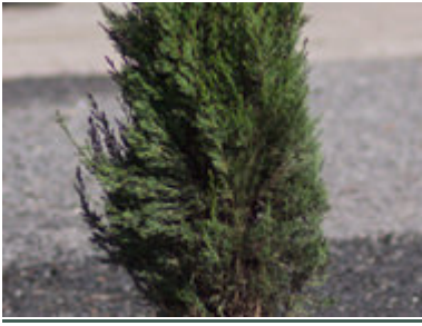
Cupressus sempervirens 'Stricta'