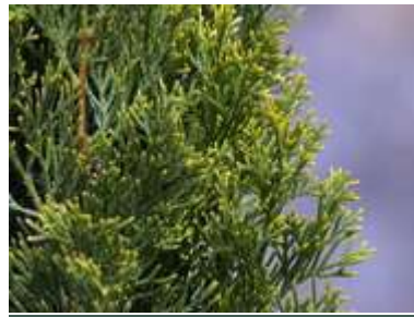
Cupressus sempervirens 'Swane's Gold'