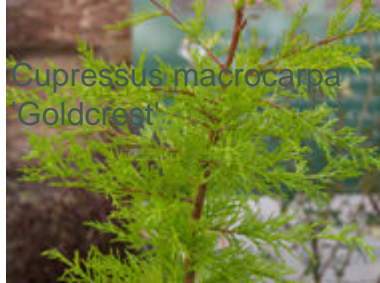
Cupressus macrocarpa 'Goldcrest'