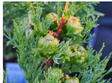
Cupressus sempervirens 'Stricta'