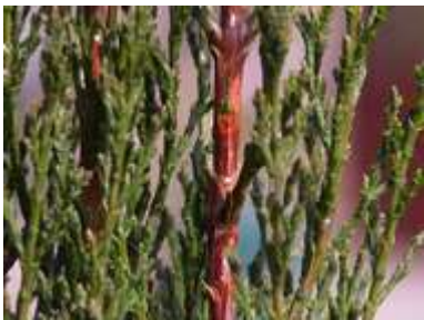
Cupressus sempervirens 'Stricta'