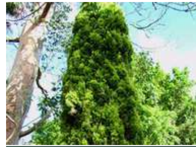
Cupressus sempervirens 'Swane's Gold'