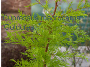
Cupressus macrocarpa 'Goldcrest'