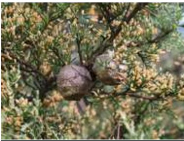
Cupressus torulosa 'Cashmeriana'

View this video on Youtube here https://www.youtube.com/QbbGPhjMHs4