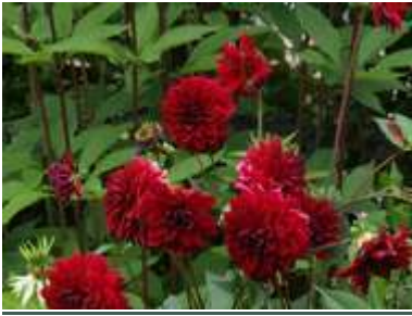
Dahlia 'Arabian Knight'