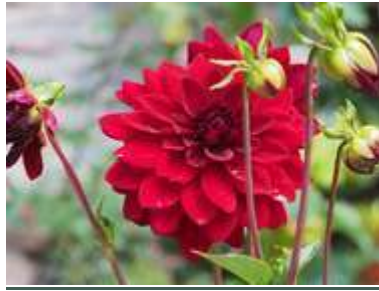
Dahlia 'Arabian Knight'