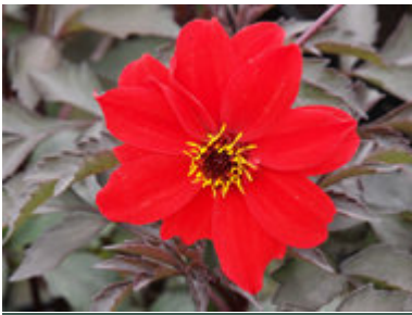
Dahlia 'Bishop of Llandaff'