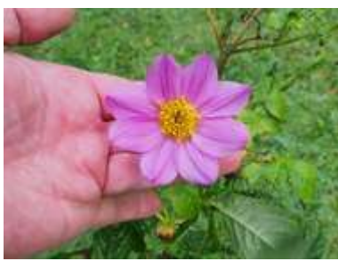
Dahlia 'Mystic Dreams'