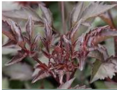
Dahlia 'Bishop of Llandaff'