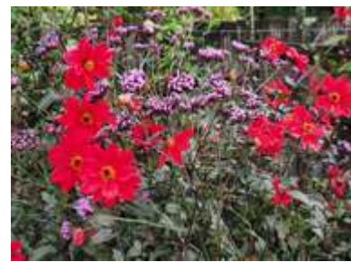
Dahlia 'Bishop of Llandaff' and V. bonariensis