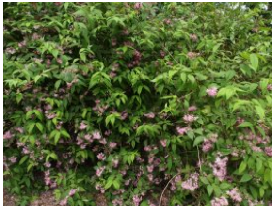
Deutzia 'Strawberry Fields'