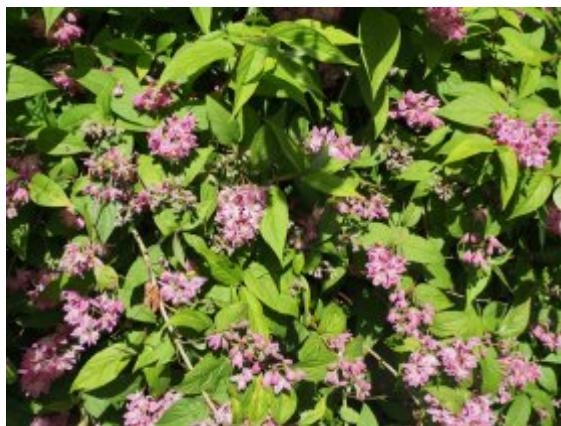
Deutzia 'Strawberry Fields'