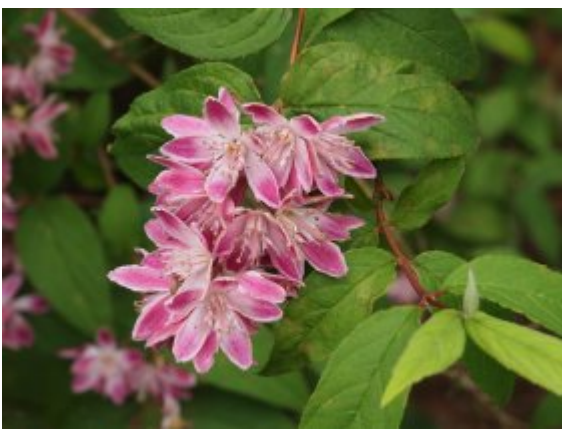
Deutzia 'Strawberry Fields'

Our selection of the three best deutzia to grow: