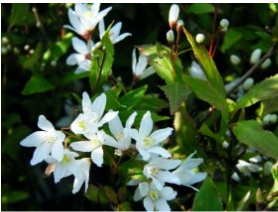
Deutzia crenata 'Nikko'

Deutzia are notoriously easy to grow and most are lime tolerant which is why they are so universally grown in the UK. They prefer a loamy soil with plenty of moisture but are not really that fussy and can thrive in poor soil or exposed locations. You will find the lower growing varieties used in quantity in supermarket car parks and on roundabouts.