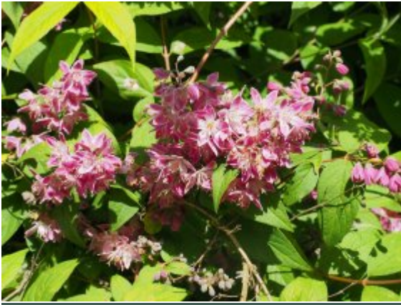
Deutzia 'Strawberry Fields'

They can easily be propagated in summer from softwood cuttings or, in the winter, from hardwood cuttings.