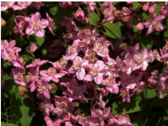
Deutzia x elegantissima 'Rosealind'