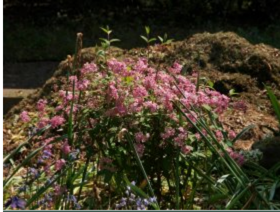
Deutzia x elegantissima 'Rosealind'