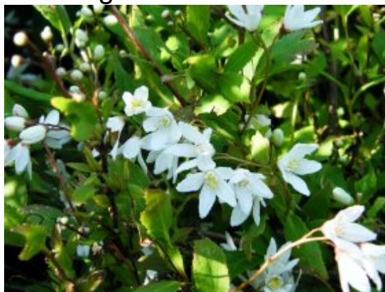
Deutzia crenata 'Nikko'

this is a taller growing form achieving 5-6ft in height. The abundant flowers are pink with attractive white stripes.