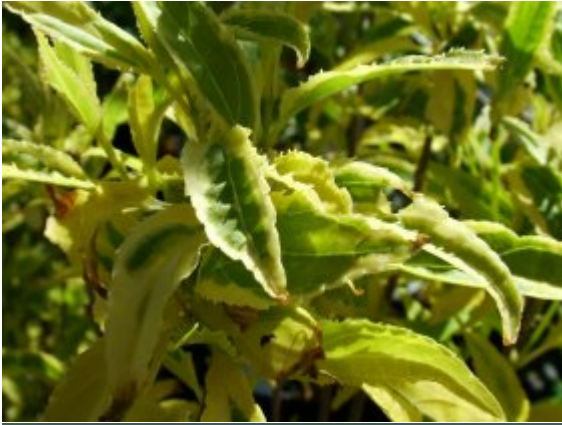
Deutzia gracilis variegata

All species and cultivars are suitable for the shrub border although the taller growing forms also make attractive free standing specimens in a woodland glade.