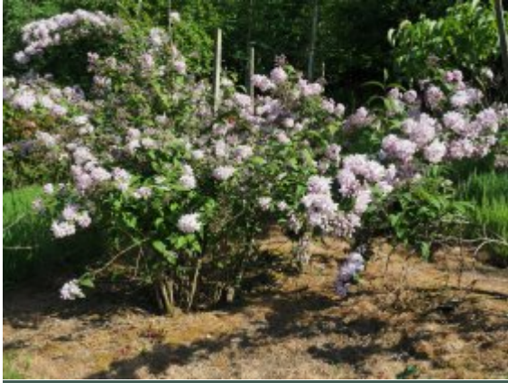
Deutzia x elegantissima 'Rosealind'

may well be helpful in encouraging more subsequent flowering. These plants can also readily be cut back hard if necessary in a border when they are dormant.