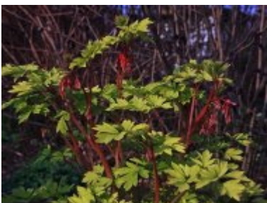
D. spectabilis 'Goldheart'