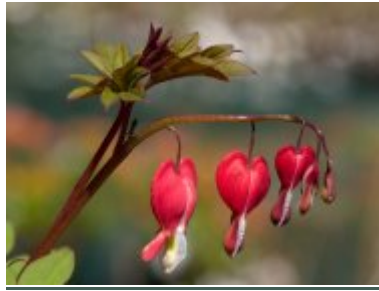
D. spectabilis 'Valentine'