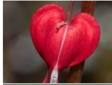
D. spectabilis 'Valentine'

Burncoose Nurseries: Gwennap, Redruth, Cornwall TR16 6BJ