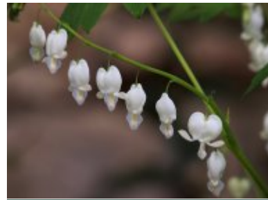
D. spectabilis 'Alba'