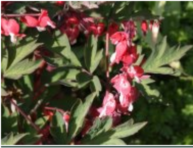
D. spectabilis 'Valentine'