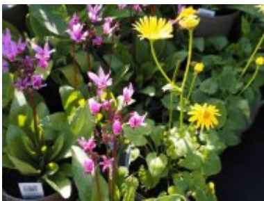
Dodecatheon meadia and Doronicum orientale

Clumps can be divided in spring but summer collected ripe seed can be sown in containers in the cold frame as soon as it is ripe.