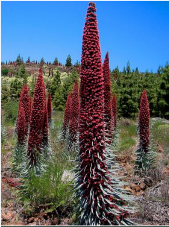
Echium 'Red Rocket'

On Tresco these impressive plants grow wild all over the islands and at Ventnor Botanic Gardens there is a huge half acre clump of echium of varying ages which is a wonderful spectacle in June and July.