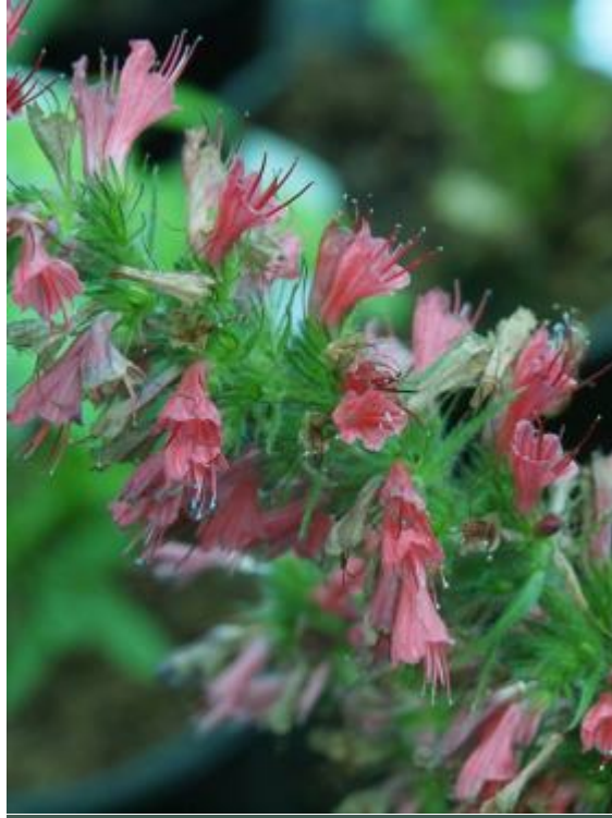
Echium 'Red Feathers'