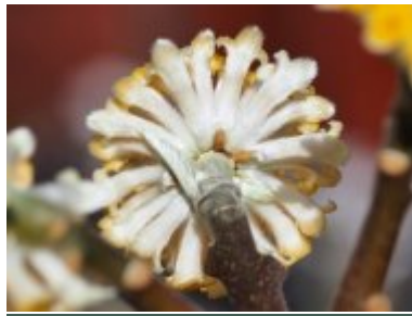
Edgeworthia chrysantha 'Grandiflora'