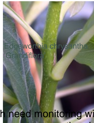
Edgeworthia chrysantha 'Grandiflora'

As greenhouse plants we have problems which need monitoring with both white fly and red spider mites on the leaves. It pays to move the plants outside if they become infested.