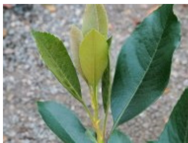
x Rhapsiobotrya 'Coppertone'