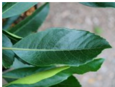
x Rhapsiobotrya 'Coppertone'