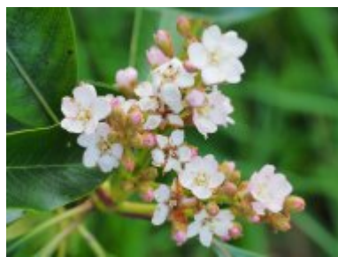
x Rhapsiobotrya 'Coppertone'