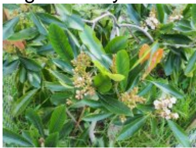
x Rhapsiobotrya 'Coppertone'

A plant which will very probably become more popular and widely grown in time when people see it in flower. As a naturally occurring bi or intergeneric hybrid we think it takes quite some beating.