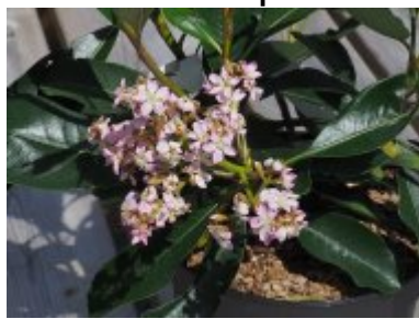
x Rhapsiobotrya 'Coppertone'