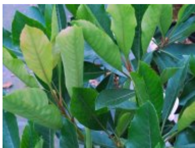
x Rhapsiobotrya 'Coppertone'