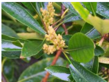
x Rhapsiobotrya 'Coppertone'