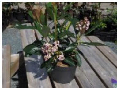
x Rhapsiobotrya 'Coppertone'