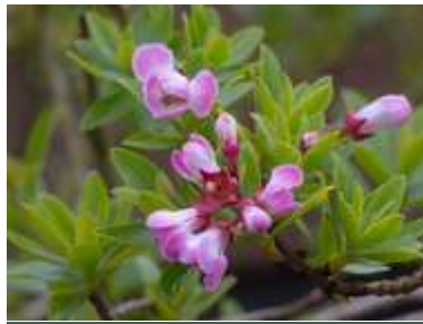
Escallonia 'Apple Blossom'