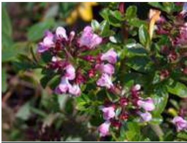
Escallonia 'Apple Blossom'