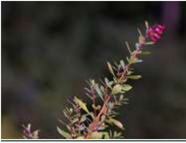
Escallonia 'Red Carpet'

Escallonia hedges require quite a bit of attention to keep them in shape and are normally no more than 3-5ft in height having been planted as a double row some 18in apart with 18in spacings between plants. Pruning should take place once a year when flowering has finished in the late summer or autumn. As Escallonia flower only on the new growth you have to give the hedge time to grow new shoots to give a decent flowering effect next season.