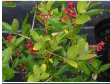
Escallonia rubra var. macrantha