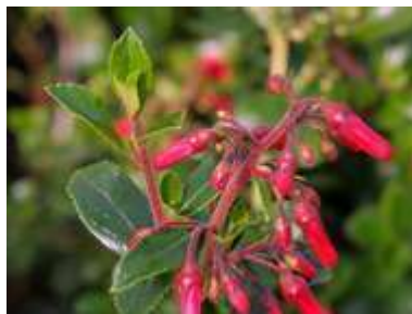
Escallonia 'Crimson Spire'