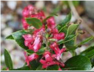
Escallonia rubra var. macrantha