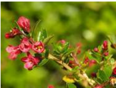
Escallonia 'Donard Radiance'