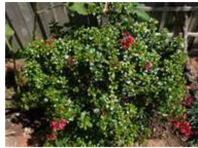
Escallonia compacta 'Coccinea'