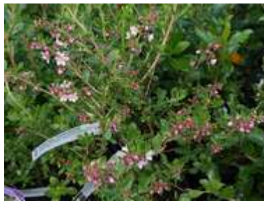
Escallonia 'Donard Seedling'