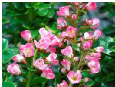
Escallonia 'Peach Blossom'