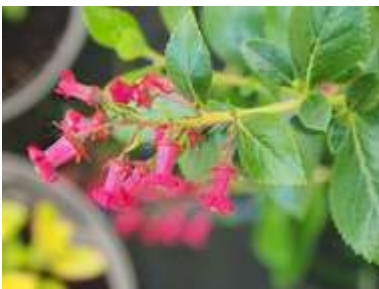
Escallonia 'Crimson Spire'

E. rubra 'Crimson Spire' is a strong growing shrub with dark glistening green leaves and bright crimson flowers.