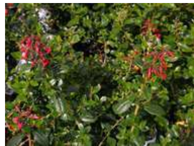
Escallonia 'Crimson Spire'