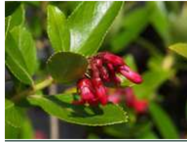
Escallonia rubra var. macrantha