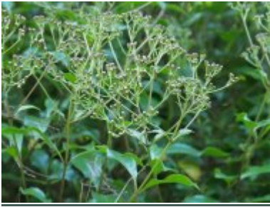
Eupatorium maculatum 'Atropurpureum'