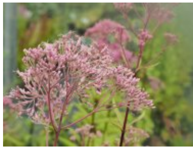
Eupatorium maculatum 'Atropurpureum'