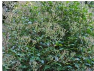
Eupatorium maculatum 'Atropurpureum'