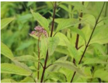
Eupatorium maculatum 'Atropurpureum'