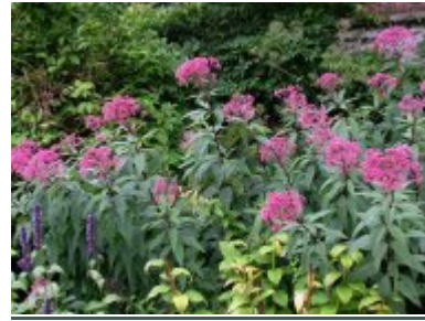
Eupatorium maculatum 'Atropurpureum'