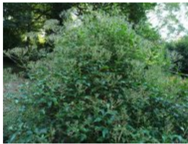
Eupatorium maculatum 'Atropurpureum'