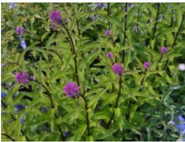
Eupatorium maculatum 'Atropurpureum'

E. maculatum 'Atropurpureum', Joe Pye weed, grows up to 6ft in height with stiff upright stems suffused purple. The flower heads are 4-6in across and are pinkish or whitish. E. rugosum 'Chocolate' (which is now annoyingly reclassified as Ageratina altissima ) grows to a similar height and has lance shaped to ovate grey-green leaves. Both these perennial forms of Eupatorium grow well in alkaline as well as acidic soil.