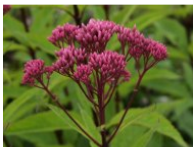
Eupatorium rugosum 'Chocolate'