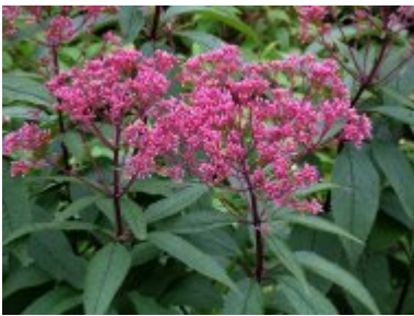
Eupatorium maculatum 'Atropurpureum'