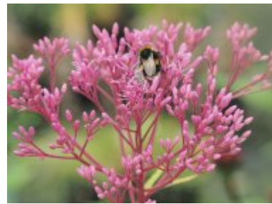
Eupatorium maculatum 'Atropurpureum'