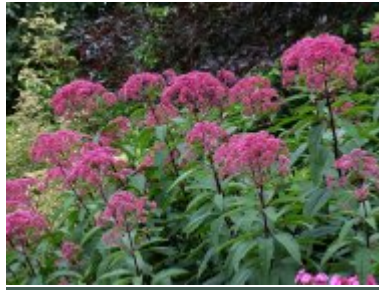
Eupatorium maculatum 'Atropurpureum'