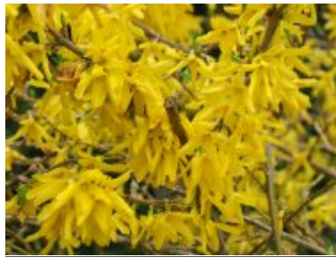
Forsythia x intermedia 'Lynwood'