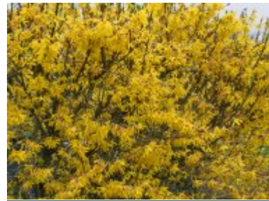
Forsythia x intermedia 'Lynwood'