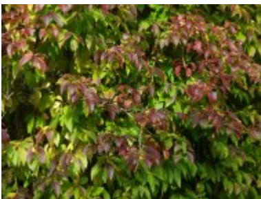
Forsythia x intermedia 'Lynwood'