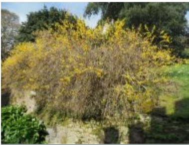
Forsythia x intermedia 'Lynwood'