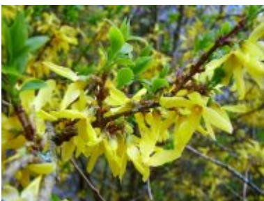
Forsythia x intermedia 'Lynwood'