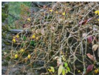
Forsythia x intermedia 'Lynwood'