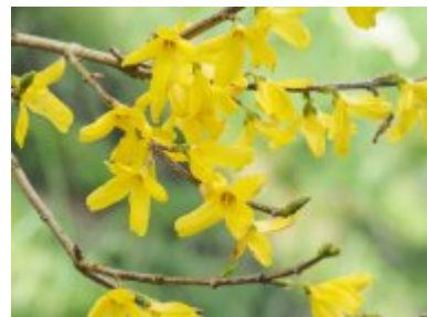
Forsythia x intermedia 'Lynwood'