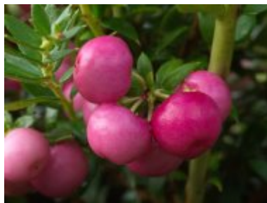
Gaultheria mucronata 'Mulberry Wine'