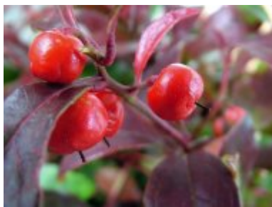
Gaultheria procumbens 'procumbens'

G. procumbens , Wintergreen, is a creeping evergreen which grows no more than 6in or so with a much larger spread. The leaves have a strong fragrance when crushed. White or pale pink racemes of flowers are followed by aromatic scarlet fruit.