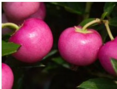
Gaultheria mucronata 'Mulberry Wine'

'Mulberry Wine' White flowers and magenta-purple berries