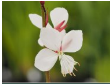
G. lindheimeri 'The Bride'