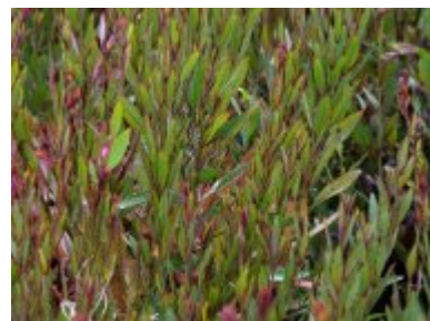
G. lindheimeri 'Siskyou Pink'