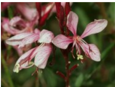
G. lindheimeri 'Passionate Blush'