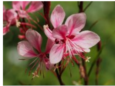
G. lindheimeri 'Passionate Blush'