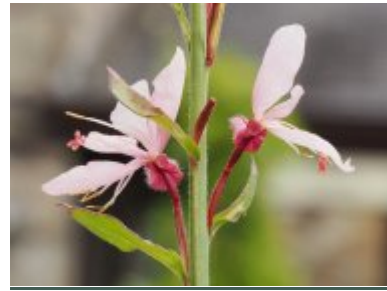
G. lindheimeri 'The Bride'

Burncoose Nurseries: Gwennap, Redruth, Cornwall TR16 6BJ