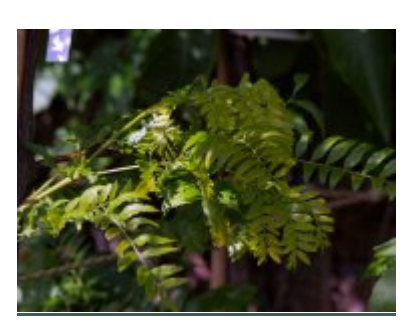
Gleditsia triacanthos 'Sunburst'