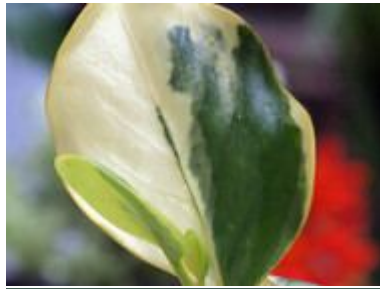
Griselinia littoralis 'Variegata'