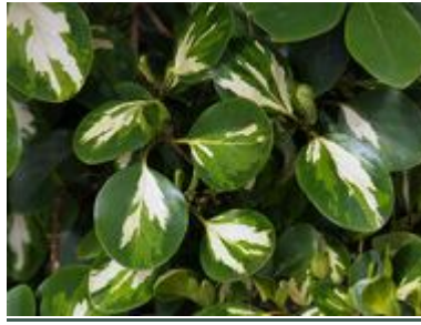
Griselinia littoralis 'Dixons Cream'