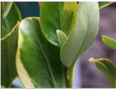
Griselinia littoralis 'Variegata'