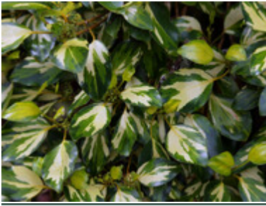
Griselinia littoralis 'Dixons Cream'