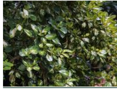
Griselinia littoralis 'Dixons Cream'