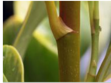
Griselinia littoralis 'Variegata'