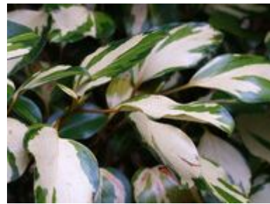
Griselinia littoralis 'Dixons Cream'