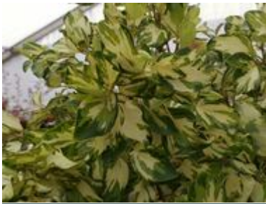
Griselinia 'Bantry Bay'

Griselinia propagate and root easily from semi ripe cuttings in midsummer or from hardwood cuttings taken in autumn and set in the cold frame. Unlike young laurels which can be attractive to rabbits Griselinia seem much less so.