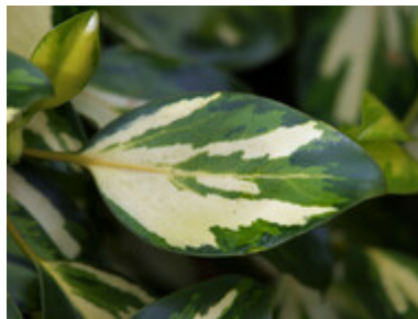
Griselinia littoralis 'Dixons Cream'