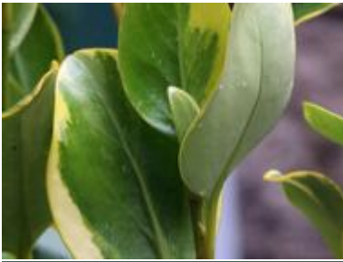
Griselinia littoralis 'Variegata'