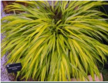
H. macra 'Aureola'