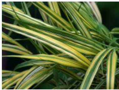
H. macra 'Albo Aurea'