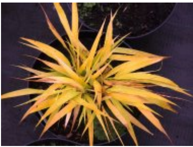
H. macra 'All Gold'