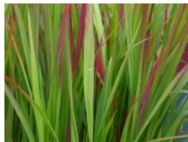
H. macra 'Albo Aurea'