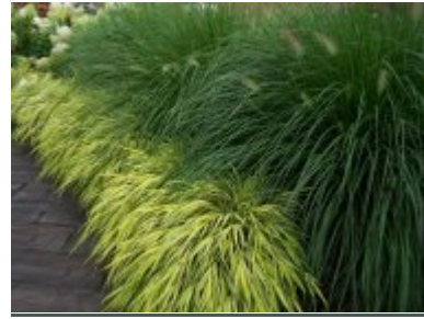
H. macra 'All Gold'