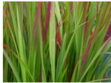
H. macra 'Albo Aurea'