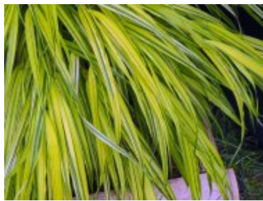
H. macra 'Aureola'