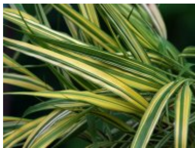
H. macra 'Albo Aurea'