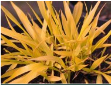
H. macra 'Sunflare'

Burncoose Nurseries: Gwennap, Redruth, Cornwall TR16 6BJ