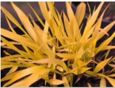
H. macra 'Sunflare'

Burncoose Nurseries: Gwennap, Redruth, Cornwall TR16 6BJ