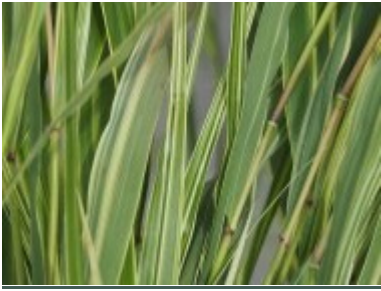
H. macra 'Albo Striata'

first year before planting out in the garden.