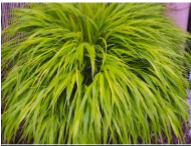
H. macra 'All Gold'