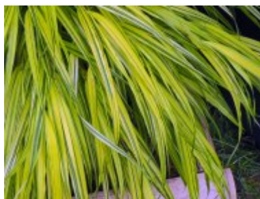
H. macra 'Aureola'