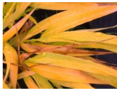
H. macra 'All Gold'