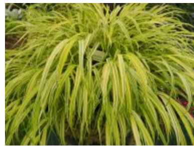
H. macra 'Aureola'