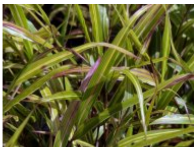
H. macra 'Albo Aurea'