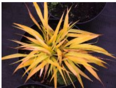
H. macra 'All Gold'