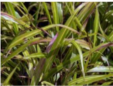
H. macra 'Albo Aurea'