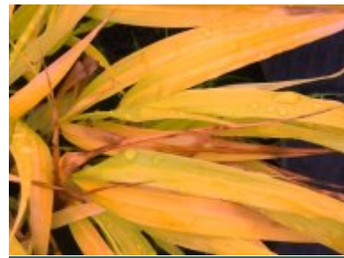
H. macra 'All Gold'