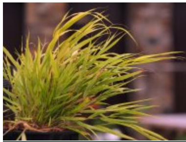
H. macra 'All Gold'