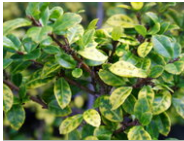
I. crenata 'Golden Gem'