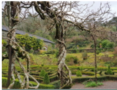
Yew - as ornate box-style