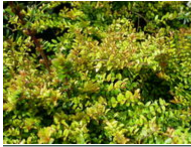
L. nitida 'Baggesens Gold'