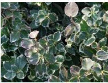
E.fortunei 'Emerald Gaiety'