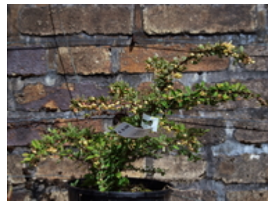
Berberis thunbergii 'Starburst'