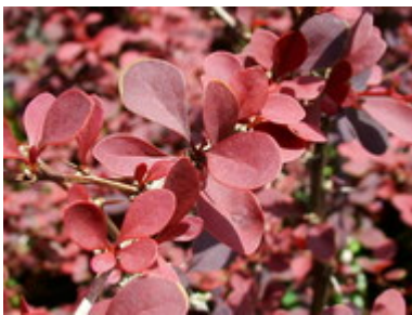
Berberis thunbergii 'Golden Ring'