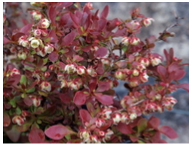
Berberis thunbergii 'Admiration'