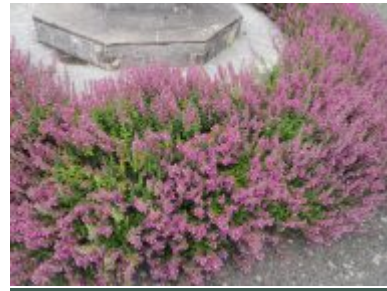
Teucrium x lucidrys