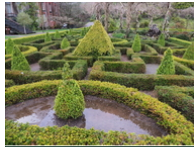
Yew - hedging