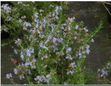
R. officinalis 'Severn Sea'