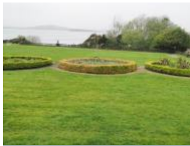
Box blight effecting centre circle