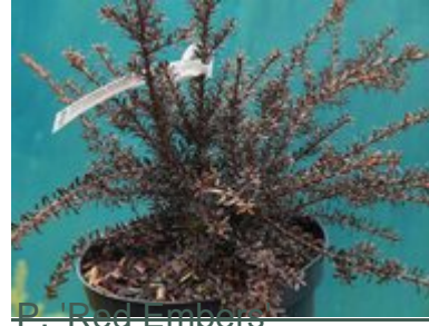
P. 'Red Embers'