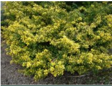
I. crenata 'Golden Gem'