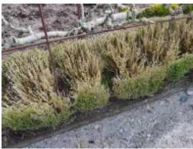
Box blight effecting