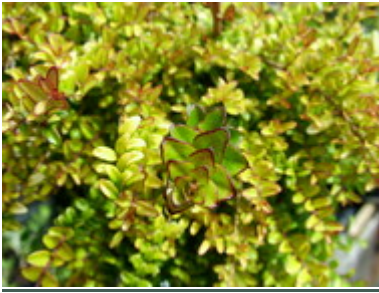
L. nitida 'Baggesens Gold'