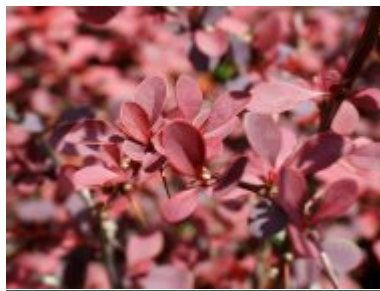
Berberis thunbergii 'Golden Ring'