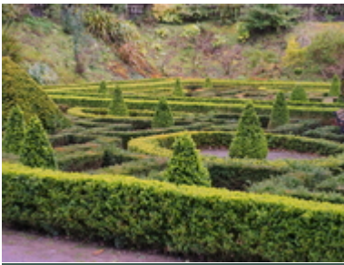
Yew - Amazing