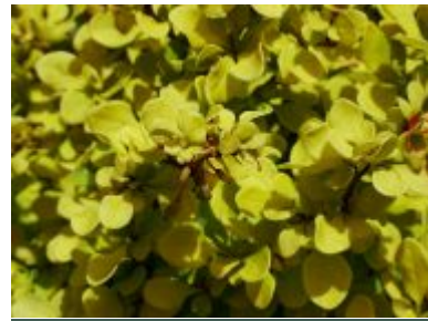
Berberis thunbergii 'Bonanza'