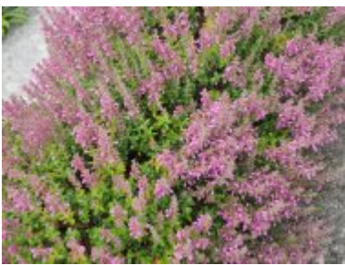
Teucrium x lucidrys