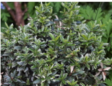
E.microphyllum pulchellum 'Variegatus'