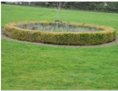
Box blight effecting circle

Box blights are fungal diseases which can attack all forms of box plants whether grown as clipped topiary plants, as border edging or as freestanding plants in a hedge. The fungus attacks the leaves and can cause severe dieback in hedges and topiary plants making them unsightly at best and mainly dead at worst. The spores of the fungus are spread by water splash and clippings being moved around the garden. All box infections are worst in moist conditions. So serious has this problem become in many established gardens that professional gardeners and landscape designers seldom now include box as a hedging plant in their designs especially in the home counties or wetter areas of the country where it is already prevalent. Rampant might be a better description.