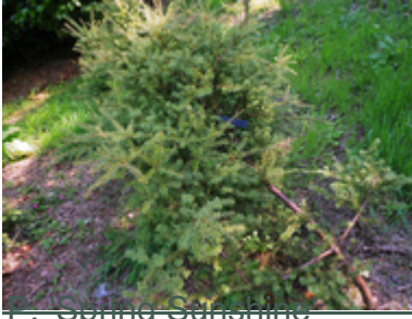
P. 'Spring Sunshine'