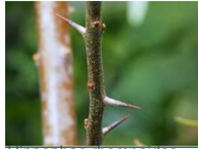
Hippophae rhamnoides 'Pollmix'