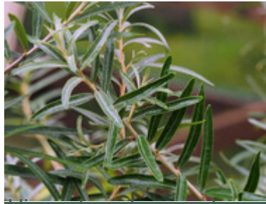
Hippophae rhamnoides 'Pollmix'