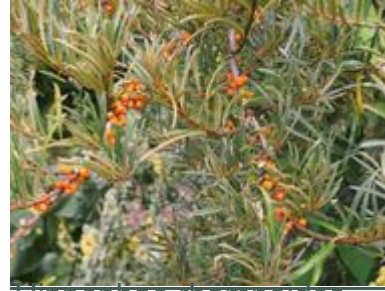
Hippophae rhamnoides 'Leikora'