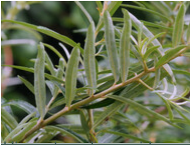
Hippophae rhamnoides 'Pollmix'