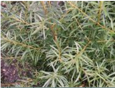
Hippophae rhamnoides 'Pollmix'

Burncoose Nurseries: Gwennap, Redruth, Cornwall TR16 6BJ