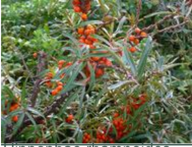
Hippophae rhamnoides 'Leikora'