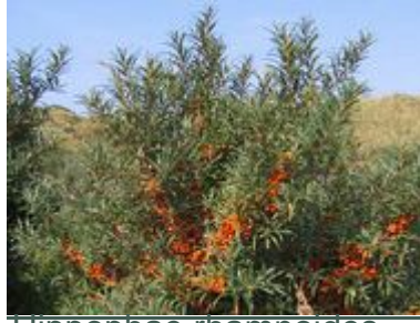
Hippophae rhamnoides 'Leikora'