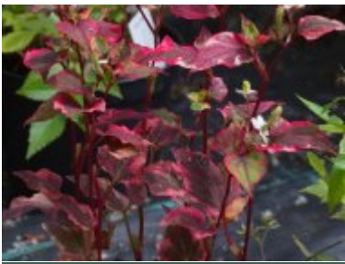
H. cordata 'Chameleon'