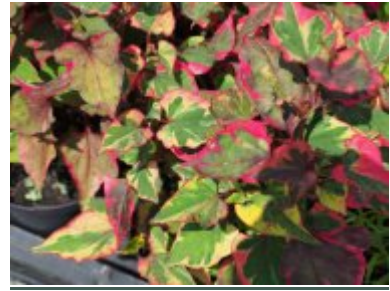
H. cordata 'Chameleon'