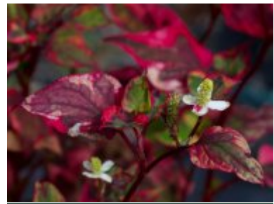
H. cordata 'Chameleon'