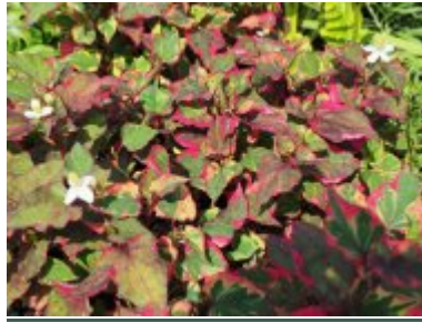
H. cordata 'Chameleon'