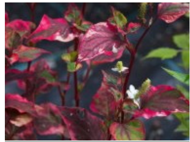
H. cordata 'Chameleon'