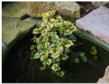
H. cordata 'Chameleon'