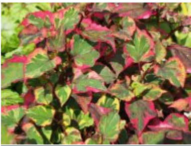
H. cordata 'Chameleon'