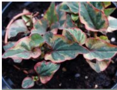
H. cordata 'Chameleon'