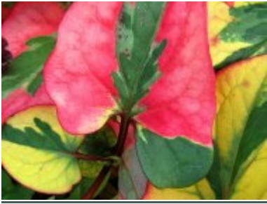
H. cordata 'Flame'