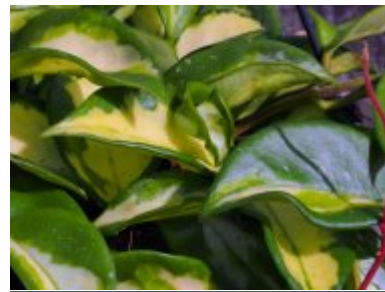
Hoya carnosa 'Tricolor'