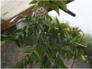
H.lanceolata subsp. 'Bella'