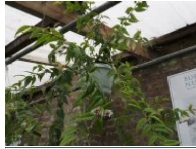
H.lanceolata subsp. 'Bella'