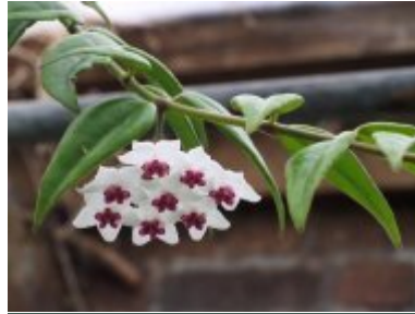
H.lanceolata subsp. 'Bella'

View this video on Youtube here https://www.youtube.com/XfXsF7hdgLg?rel=0