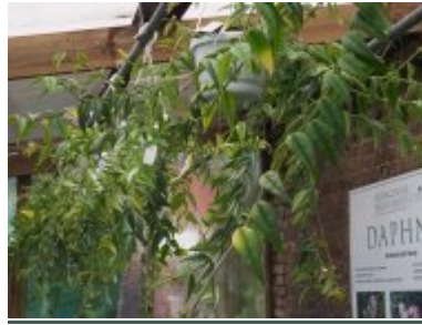
H.lanceolata subsp. 'Bella'