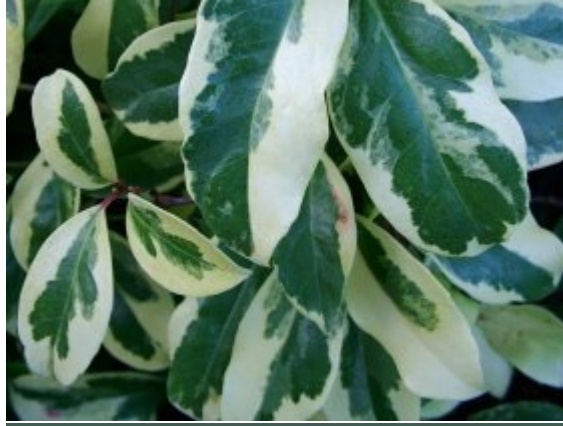
Kadsura japonica 'Variegata'

Burncoose Nurseries: Gwennap, Redruth, Cornwall TR16 6BJ