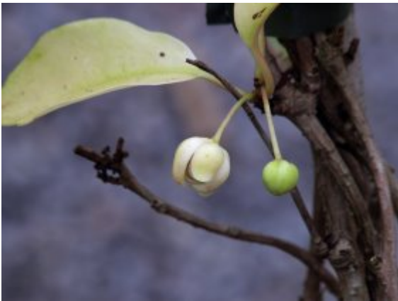
Kadsura japonica 'Fructo Albo'