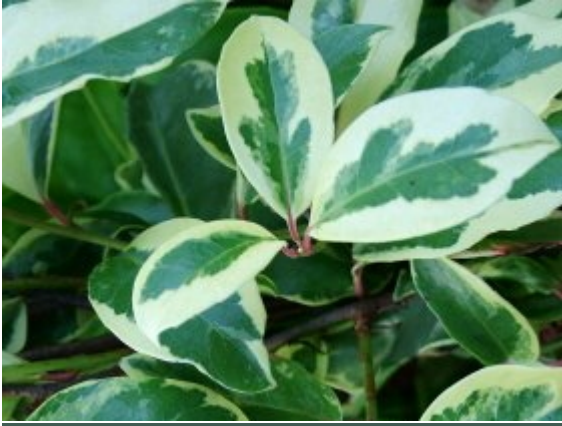
Kadsura japonica 'Variegata'