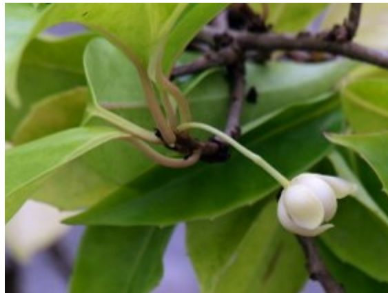
Kadsura japonica 'Fructo Albo'