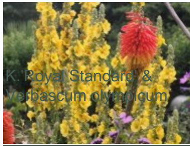
K. 'Royal Standard' & Verbascum olympicum

Burncoose Nurseries: Gwennap, Redruth, Cornwall TR16 6BJ