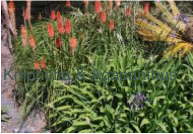
K.'Royal Castle' & Agapanthus