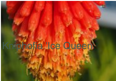
Kniphofia 'Ice Queen'