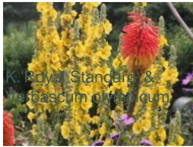
K.'Royal Standard' & Verbascum olympicum

Burncoose Nurseries: Gwennap, Redruth, Cornwall TR16 6BJ