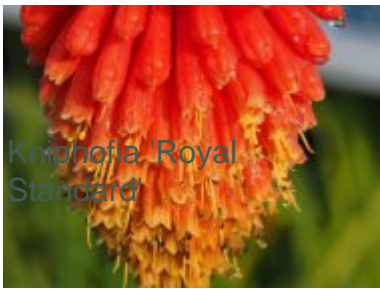
Kniphofia 'Royal Standard'