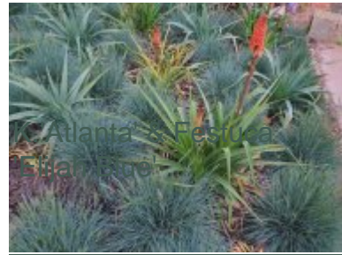
K.'Atlanta' & Festuca Sialia