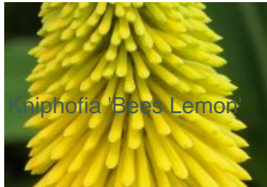
Kniphofia 'Bees Lemon'