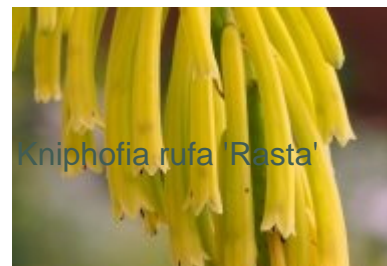
Kniphofia rufa 'Rasta'