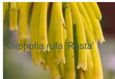
Kniphofia rufa 'Rasta'