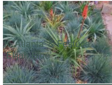
K. 'Atlanta' & Festuca 'Blue Rondo'