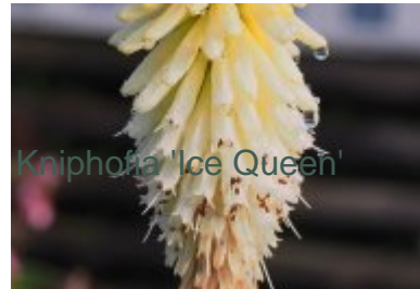
Kniphofia 'Ice Queen'