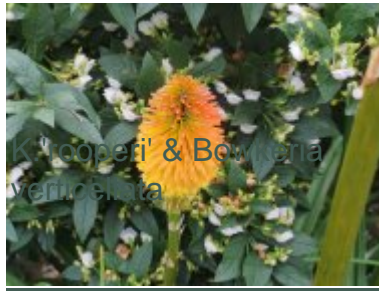
K. 'cooperi' & Boraginifera verticillata