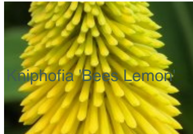
Kniphofia 'Bees Lemon'