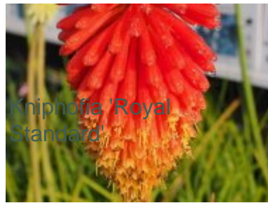
Kniphofia 'Royal Standard'