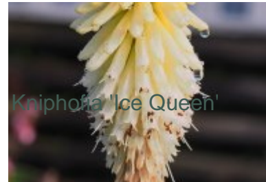
Kniphofia 'Ice Queen'