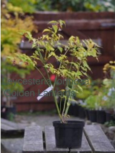
Leycesteria formosa 'Golden Lanterns'