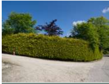
× Cupressocyparis leylandii 'Castlewellan'