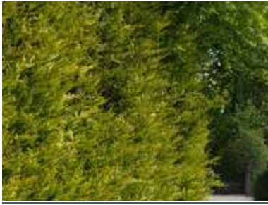
× Cupressocyparis leylandii 'Castlewellan'