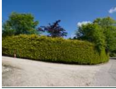
x Cupressocyparis leylandii 'Castlewellan'

Burncoose Nurseries: Gwennap, Redruth, Cornwall TR16 6BJ