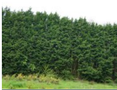
× Cupressocyparis leylandii