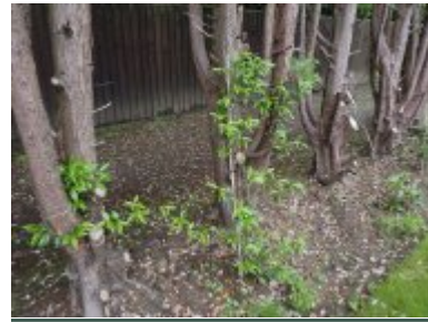
Leylandii as a hedge

Burncoose Nurseries: Gwennap, Redruth, Cornwall TR16 6BJ