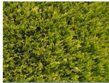
× Cupressocyparis leylandii 'Castlewellan'