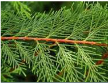
× Cupressocyparis leylandii

So it is a love/hate plant which has great value in the right context and very little – quite the reverse – in so many others!