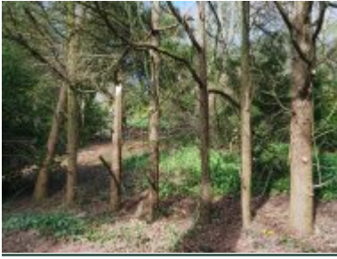
Leylandii no new growth