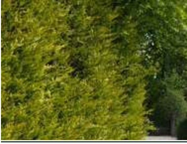
x Cupressocyparis leylandii 'Castlewellan'