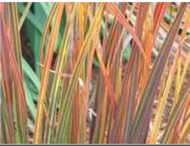
Libertia 'Taupo Sunset'