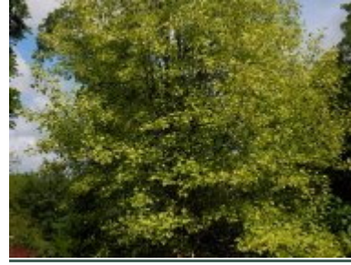
Liriodendron tulipifera 'Aureomarginata'