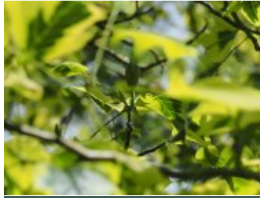
Liriodendron tulipifera 'Aureomarginata'