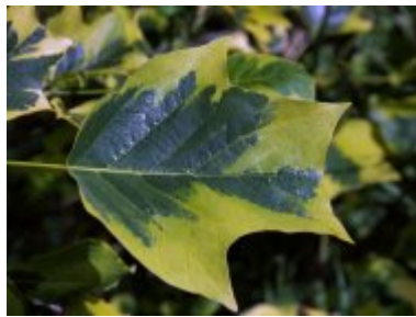
Liriodendron tulipifera 'Aureomarginata'

View this video on Youtube here https://www.youtube.com/5IBMx8LWQOg