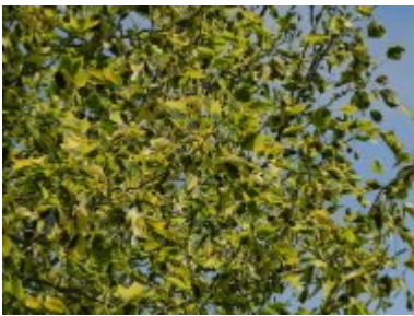
Liriodendron tulipifera 'Aureomarginata'