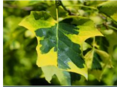
Liriodendron tulipifera 'Aureomarginata'