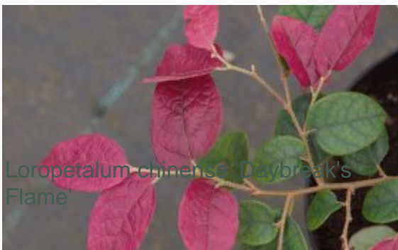
Loropetalum chinense 'Daybreak's Flame'