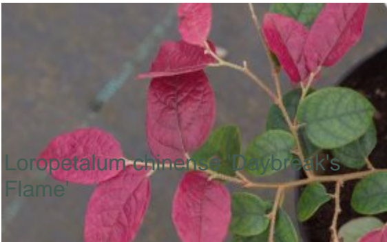
Loropetalum chinense 'Daybreak's Flame'