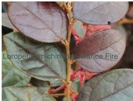
Loropetalum chinense 'Dance Fire'