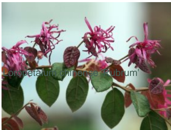
Loropetalum chinense 'Rubrum'

Burncoose Nurseries: Gwennap, Redruth, Cornwall TR16 6BJ