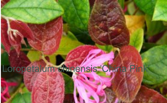
Loropetalum chinensis 'China Pink'