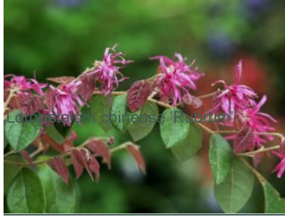
Loropetalum chinense 'Rubrum'