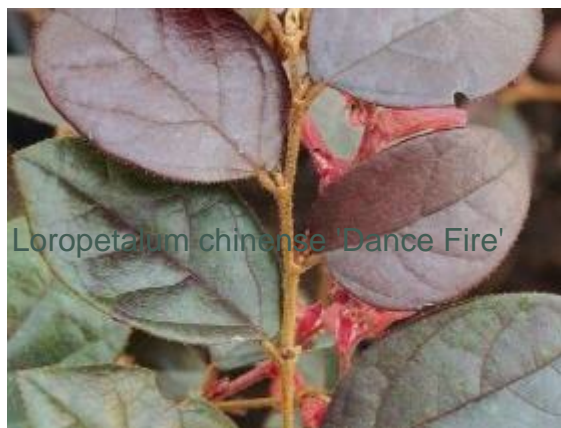
Loropetalum chinense 'Dance Fire'