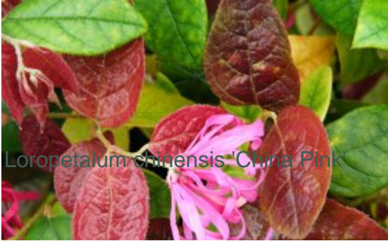
Loropetalum chinensis 'China Pink'