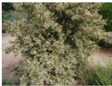
Luma apiculata 'Glenlean Gold'