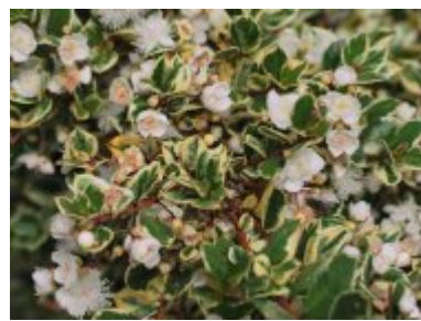
Luma apiculata 'Glenlean Gold'