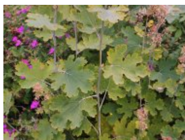
Macleya microcarpa 'Kelways Coral Plume'