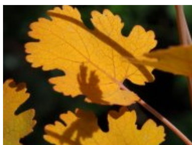
Macleya microcarpa 'Kelways Coral Plume'