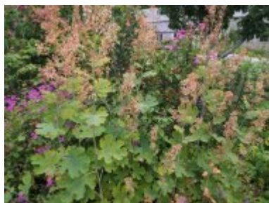
Macleya microcarpa 'Kelways Coral Plume'