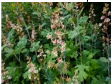
Macleya microcarpa 'Kelways Coral Plume'

later. When you see the rhizomes you will see why this plant will seldom do well in a small pot!