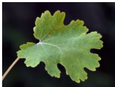
Macleya microcarpa 'Kelways Coral Plume'