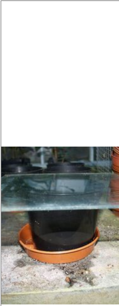
7. Cover pot with glass