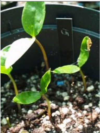
10. Small seedlings