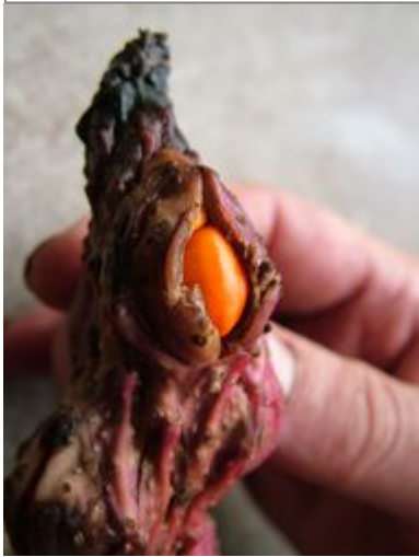
2. Close up of orange seed