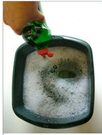
3. Washing up liquid