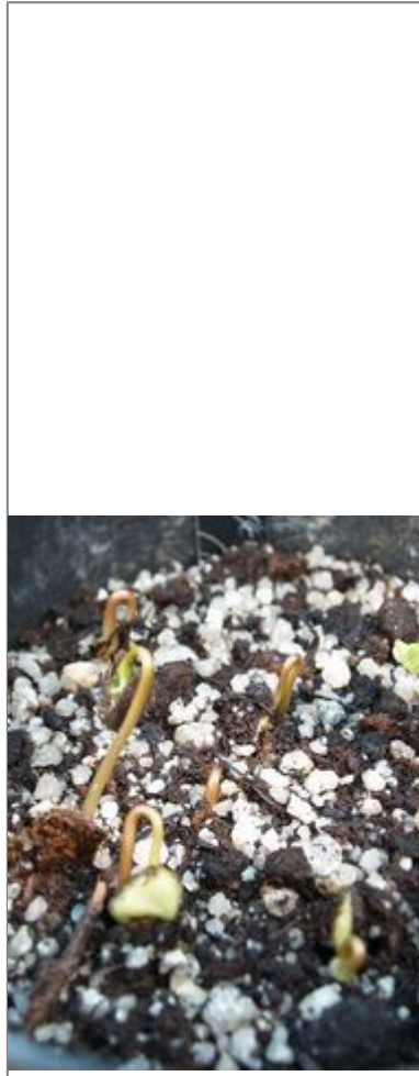
8. Germinating seeds