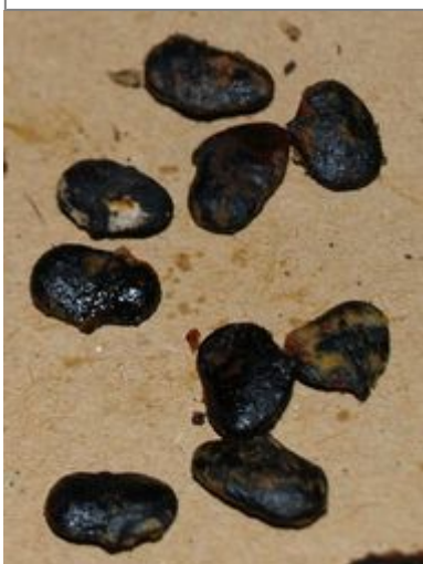
5. Seeds ready to plant