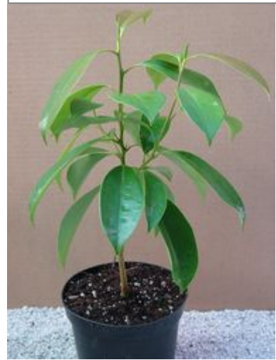
12. Ready to plant in the garden

Figs. 1 & 2. When you have collected your long ripe magnolia seed pods and their bright orange seeds, remove the seeds from the pods and store