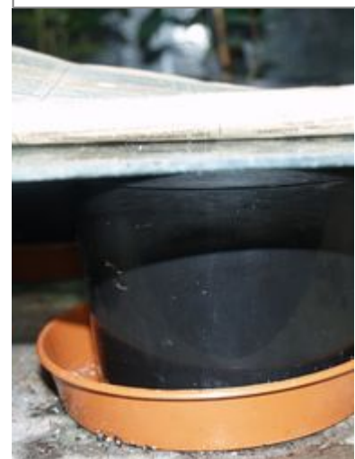
9. Further cover with newspaper