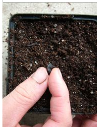
6. Planting into compost