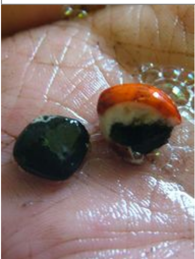
4. Washing off orange skin