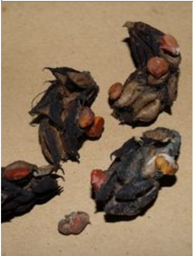
1. Magnolia seed pods