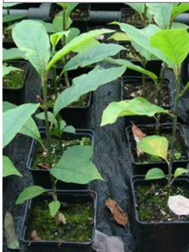
11. Established seedlings