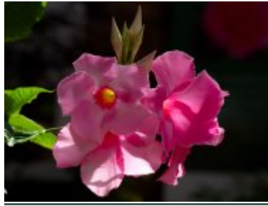
Mandevilla 'Alice du Pont'