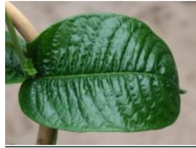
Mandevilla 'Alice du Pont'