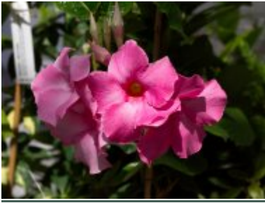
Mandevilla 'Alice du Pont'