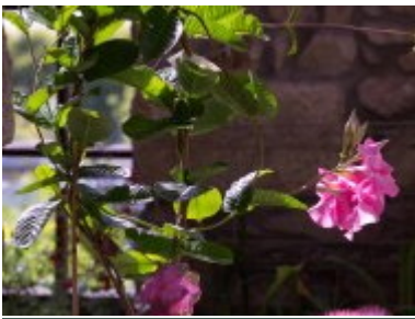
Mandevilla 'Alice du Pont'