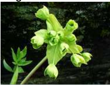
Mathiasella bupleuroides 'Green Dream'

When established and mature this plant will grow to between 3 and 5ft with a spread of 2-2½ft. Clumps can be divided when dormant in early spring.