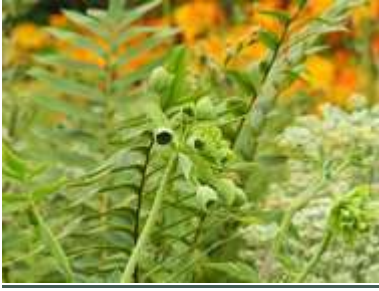
Mathiasella bupleuroides 'Green Dream'

Burncoose Nurseries: Gwennap, Redruth, Cornwall TR16 6BJ