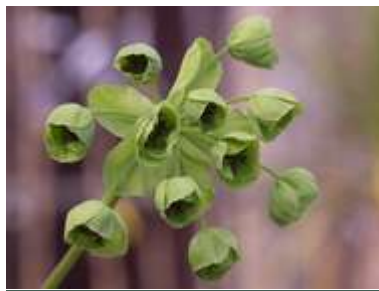
Mathiasella bupleuroides 'Green Dream'