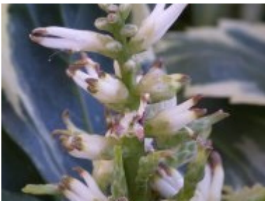
Pachysandra terminalis 'Variegata'