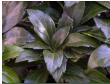
Pachysandra terminalis 'Green Carpet'