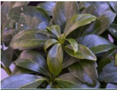
Pachysandra terminalis 'Green Carpet'

P. terminalis 'Green Carpet' is a more compact form with smaller more finely toothed leaves.