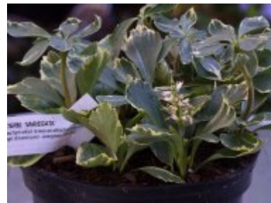
Pachysandra terminalis 'Variegata'