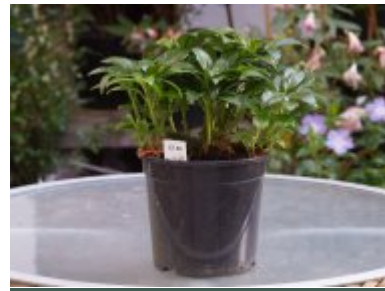
Pachysandra terminalis 'Green Carpet'