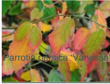
Parrotia persica 'Vanessa'