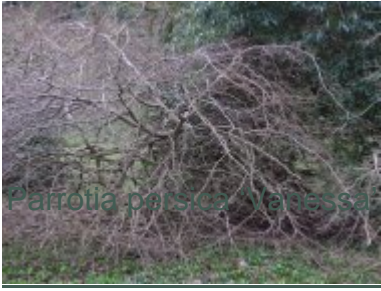
Parrotia persica 'Vanessa'