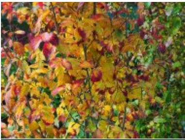
Parrotia persica 'Persian Spire'