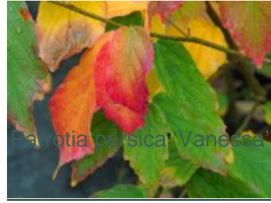
Parrotia persica 'Vanessa'