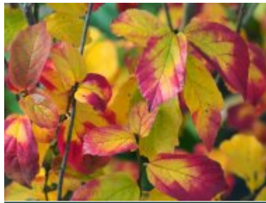
Parrotia persica 'Persian Spire'