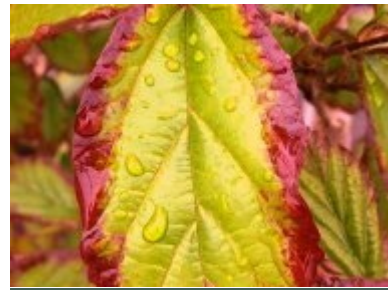
Parrotia persica 'Persian Spire'