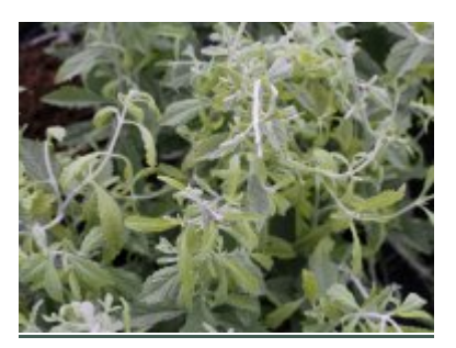
Perovskia 'Silvery Blue'