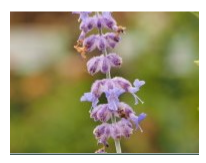
Perovskia 'Silvery Blue'