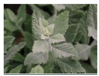
Perovskia 'Silvery Blue'