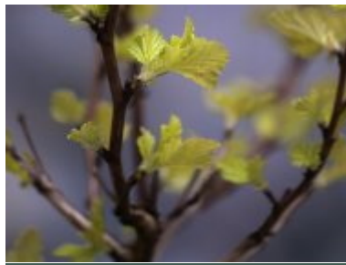
Physocarpus opulifolius 'Dart's Gold'