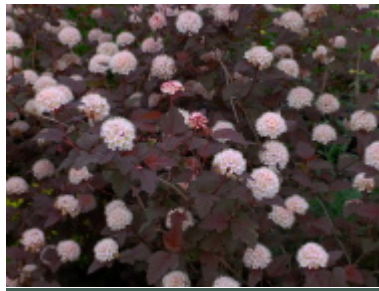
Physocarpus opulifolius 'Lady in Red'