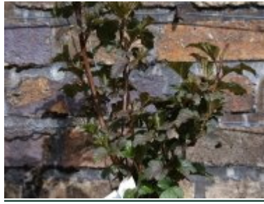
Physocarpus opulifolius 'Diabolo'