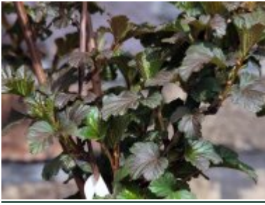
Physocarpus opulifolius 'Diabolo'