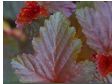
Physocarpus opulifolius 'Lady in Red'