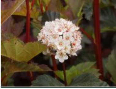
Physocarpus opulifolius 'Summer Moon'