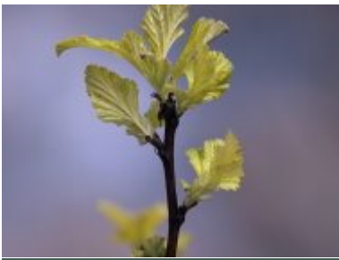
Physocarpus opulifolius 'Dart's Gold'

'Dart's Gold' is a compact shrub with bright long lasting yellow foliage fading to green.