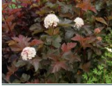
Physocarpus opulifolius 'Summer Moon'

Greenwood cuttings taken in summer and set on the mist bench with bottom heat is the easiest way to propagate these attractive plants.