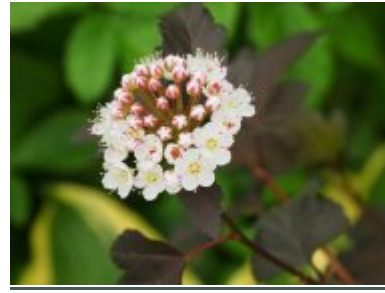
Physocarpus opulifolius 'Diabolo'