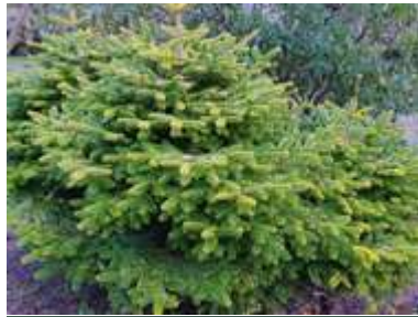
Picea glauca var. albertiana 'Piccolo'

Burncoose Nurseries: Gwennap, Redruth, Cornwall TR16 6BJ