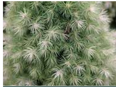
Picea glauca var albertiana 'Daisy's White'