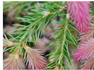
Picea abies 'Rydal'