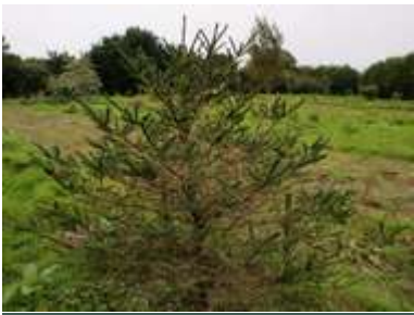
Picea pungens 'Glauca'