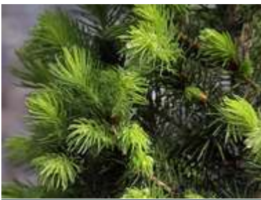
Picea glauca var albertiana 'Conica'