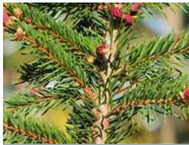
Picea abies 'Rydal'