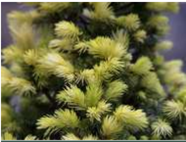
Picea glauca var albertiana 'Daisy's White'