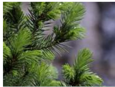
Picea glauca var albertiana 'Conica'