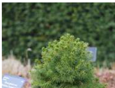
Picea glauca var albertiana 'Conica'