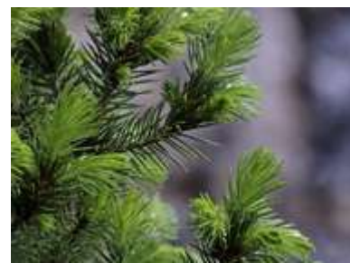
Picea glauca var albertiana 'Conica'