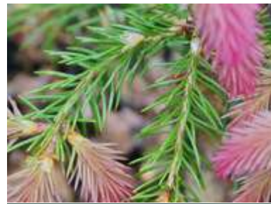
Picea abies 'Rydal'