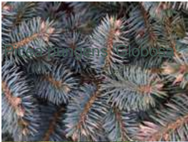
Picea pungens 'Globosa'