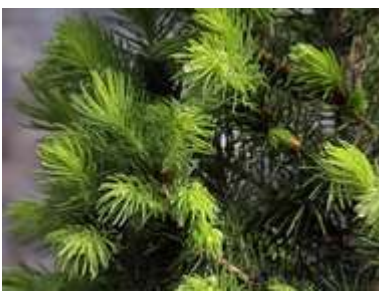
Picea glauca var albertiana 'Conica'