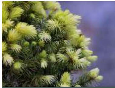
Picea glauca var albertiana 'Daisy's White'