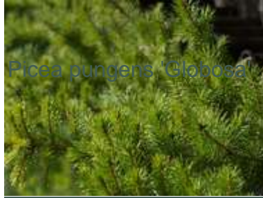
Picea pungens 'Globosa'