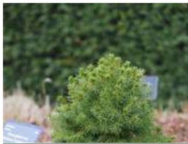
Picea glauca var albertiana 'Conica'