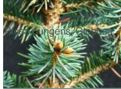
Picea pungens 'Globosa'