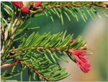
Picea abies 'Rydal'

P. abies 'Rydal' grows up to 6-8ft which makes it a bit big for most rockeries although it can be a feature plant in a heather garden. It is best grown as a freestanding shrub where its extraordinarily odd and striking dark red new growth can be appreciated.