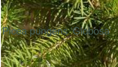
Picea pungens 'Globosa'