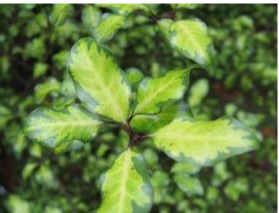
Pittosporum tenifolium 'Tandara Gold'