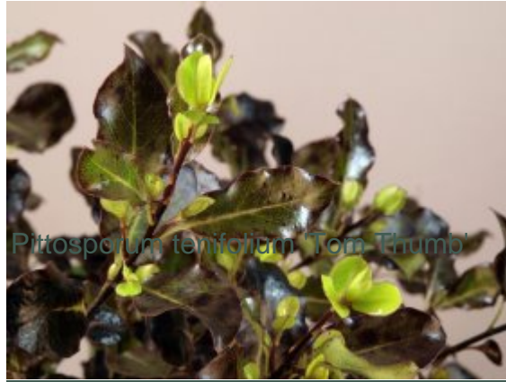
Pittosporum tenifolium 'Tom Thumb'