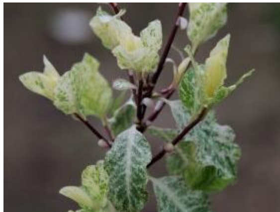
Pittosporum tenifolium 'Irene Paterson'