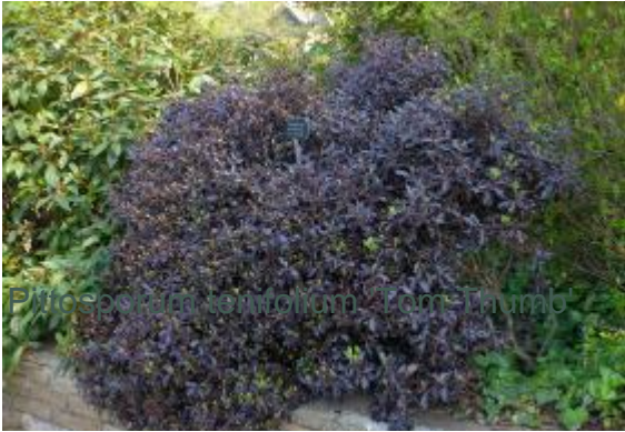
Pittosporum tenifolium 'Tom Thumb'