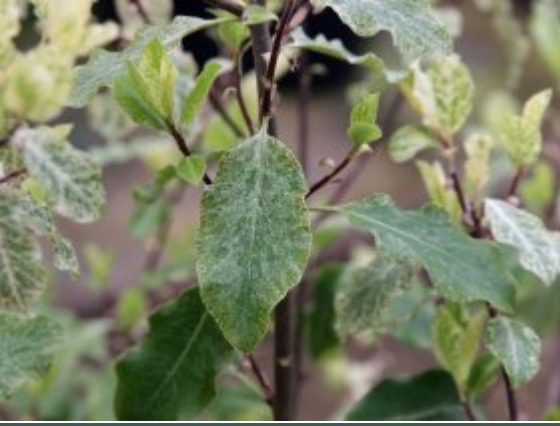
Pittosporum tenifolium 'Irene Paterson'