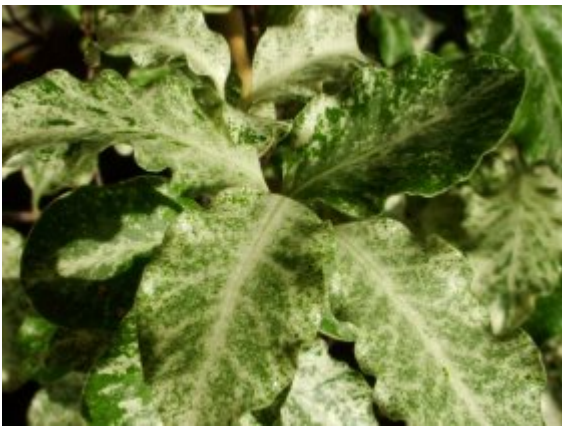
Pittosporum tenifolium 'Irene Paterson'