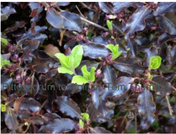
Pittosporum tenifolium 'Tom Thumb'