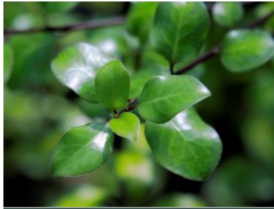
Pittosporum tenifolium 'Tandara Gold'