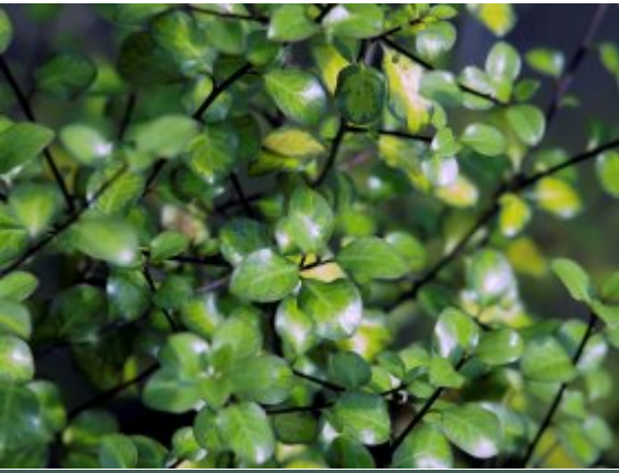
Pittosporum tenifolium 'Tandara Gold'