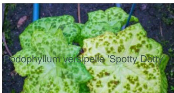
Podophyllum versipelle 'Spotty Dotty'