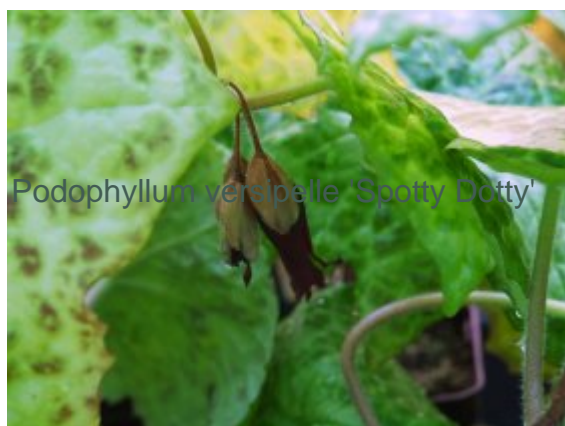
Podophyllum versipelle 'Spotty Dotty'