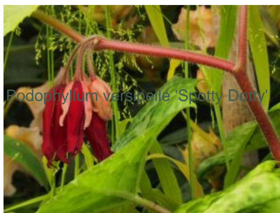
Podophyllum versipelle 'Spotty Dotty'