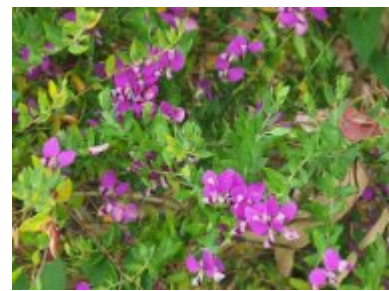
Polygala myrtifolia 'Grandiflora'