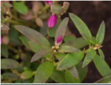
Polygala chamaebuxus 'Grandiflora'