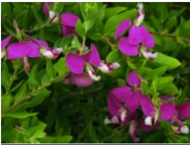
Polygala myrtifolia 'Grandiflora'