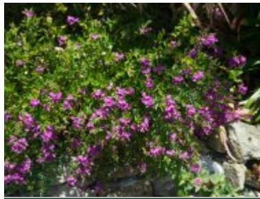
Polygala myrtifolia 'Grandiflora'