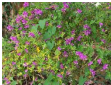
Polygala myrtifolia 'Grandiflora'