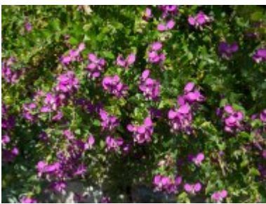
Polygala myrtifolia 'Grandiflora'