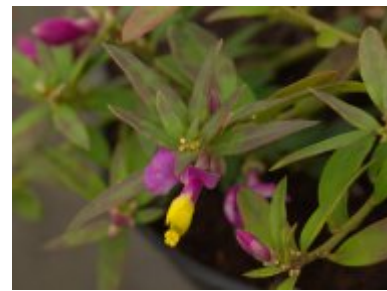
Polygala chamaebuxus 'Grandiflora'