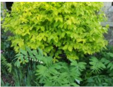
P. multiflorum & Philadelphus coronarius 'Aureus'