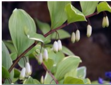
P. multiflorum 'Variegatum'