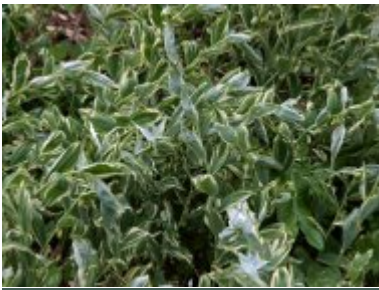
P. multiflorum 'Variegatum'