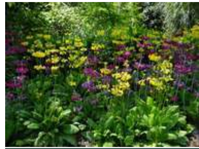
Primula helodoxa & Primula pulverulenta