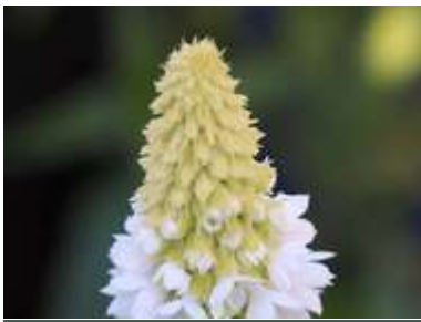
Primula vialii 'Alison Holland'

Burncoose Nurseries: Gwennap, Redruth, Cornwall TR16 6BJ