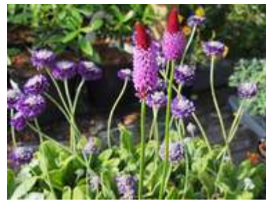
Primula capitata & Primula vialii