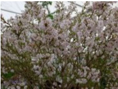
Prunus incisa 'Kojo No Mai'