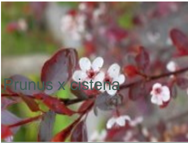
Prunus x cistena