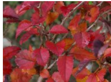
Prunus incisa 'Kojo No Mai'