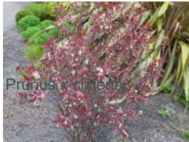
Prunus x cistena