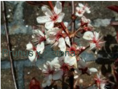
Prunus x cistena