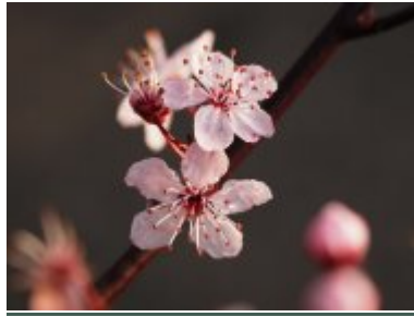
Prunus cerasifera 'Nigra'