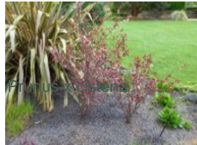
Prunus x cistena