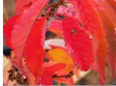
Prunus nipponica 'Brilliant'