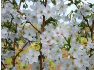
Prunus nipponica 'Brilliant'