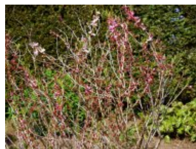
Prunus tenella 'Fire Hill'