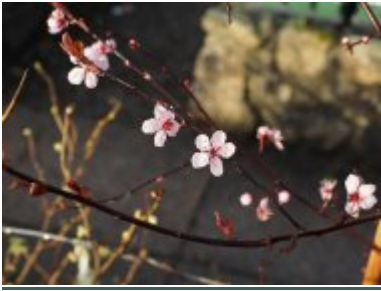
Prunus cerasifera 'Nigra'