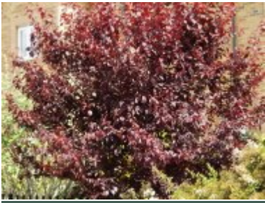
Prunus cerasifera 'Nigra'