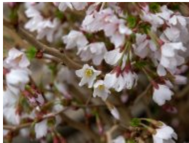
Prunus incisa 'Kojo No Mai'