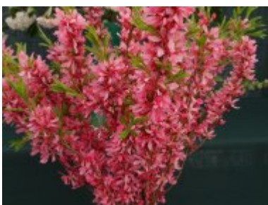
Prunus tenella 'Fire Hill'

P. tenella 'Fire Hill' is a form of the dwarf Russian almond which grows as a suckering spreading shrub into a 5x5ft shrub in maturity. It has bowl shaped dark pink flowers in March and small almond-like grey-yellow fruit in the autumn. This is a mixed border or even a rockery plant and thrives when grown with heathers in a peaty heather bed.