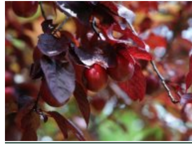
Prunus cerasifera 'Nigra'