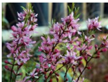
Prunus tenella 'Fire Hill'