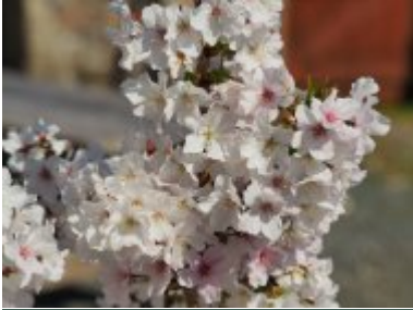
Prunus nipponica 'Brilliant'

P. nipponica var. kurilensis 'Brilliant' has a compact dwarf habit with white flowers which fade to soft pink.