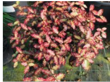
Pseudowintera 'Red Leopard'