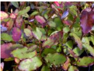
Pseudowintera 'Red Leopard'