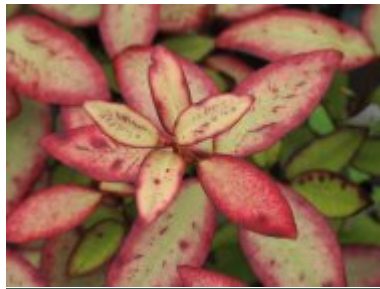
Pseudowintera 'Moulin Rouge'