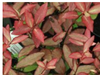
Pseudowintera 'Red Glow'