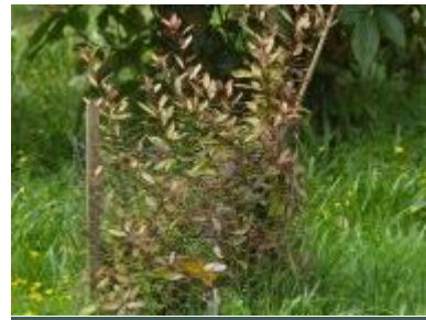
Pseudowintera 'Marjorie Congreve'