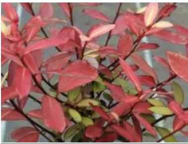
Pseudowintera 'Red Glow'

Burncoose Nurseries: Gwennap, Redruth, Cornwall TR16 6BJ