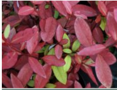
Pseudowintera 'Red Glow'