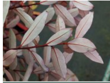
Pseudowintera 'Red Glow'