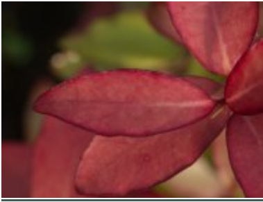
Pseudowintera 'Red Glow'