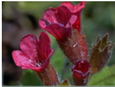
P. officinalis 'Rubra'