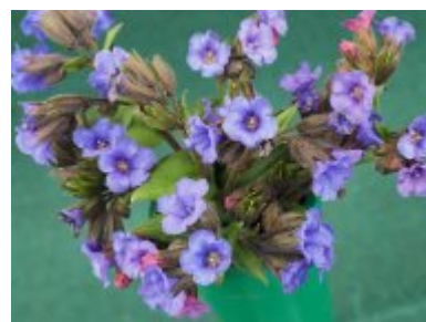
P. 'Blue Ensign'