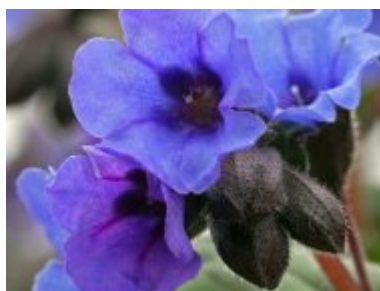
P. 'Blue Ensign'