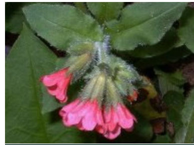
P. officinalis 'Rubra'