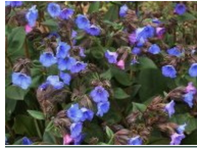
P. 'Blue Ensign'