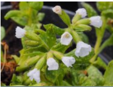
P. officinalis 'Rubra'