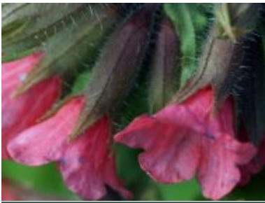
P. officinalis 'Rubra'