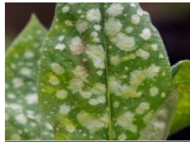
P. officinalis 'Rubra'

Burncoose Nurseries: Gwennap, Redruth, Cornwall TR16 6BJ