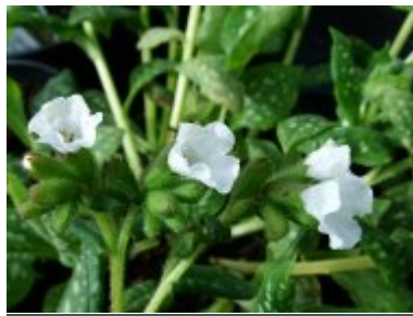
P. officinalis 'Rubra'