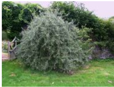
Pyrus salicifolia 'Pendula'