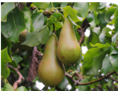
Pyrus 'Doyenne du Comice'