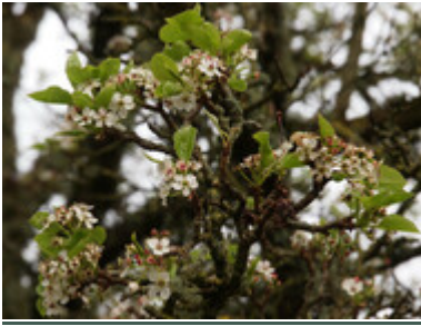
Pyrus calleryana 'Chanticleer'