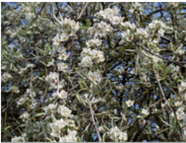
Pyrus salicifolia 'Pendula'