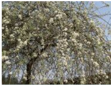
Pyrus salicifolia 'Pendula'