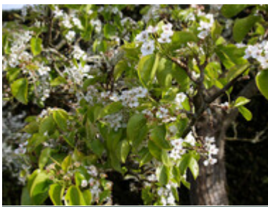
Pyrus calleryana 'Chanticleer'

P. calleryana 'Chanticleer' is a narrowly conical tree growing, eventually, to about 20ft in height. Its leaves and racemes of white umbel-like flowers, which appear in mid spring, are very similar to those of standard culinary or desert pear trees. This tree has however a number of differences in that it is often thorny and the fruits are fairly tiny, brown and rounded.