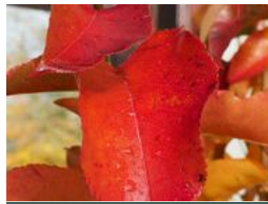
Pyrus calleryana 'Chanticleer'