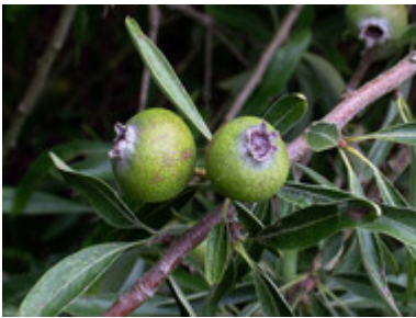
Pyrus salicifolia 'Pendula'