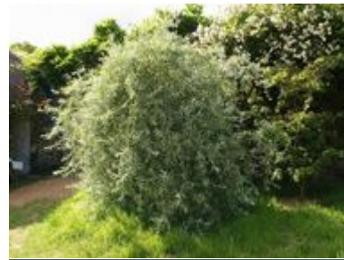
Pyrus salicifolia 'Pendula'